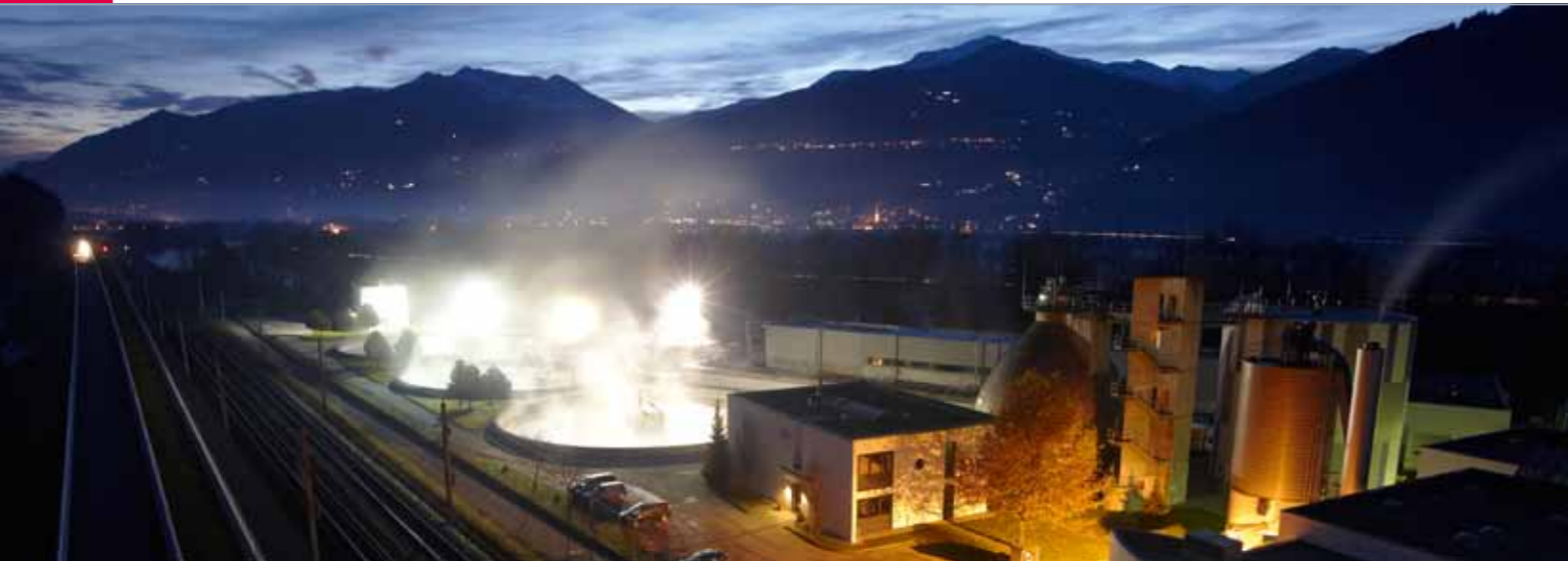
Fritzens, Austria, 6L21/31